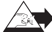
After each use